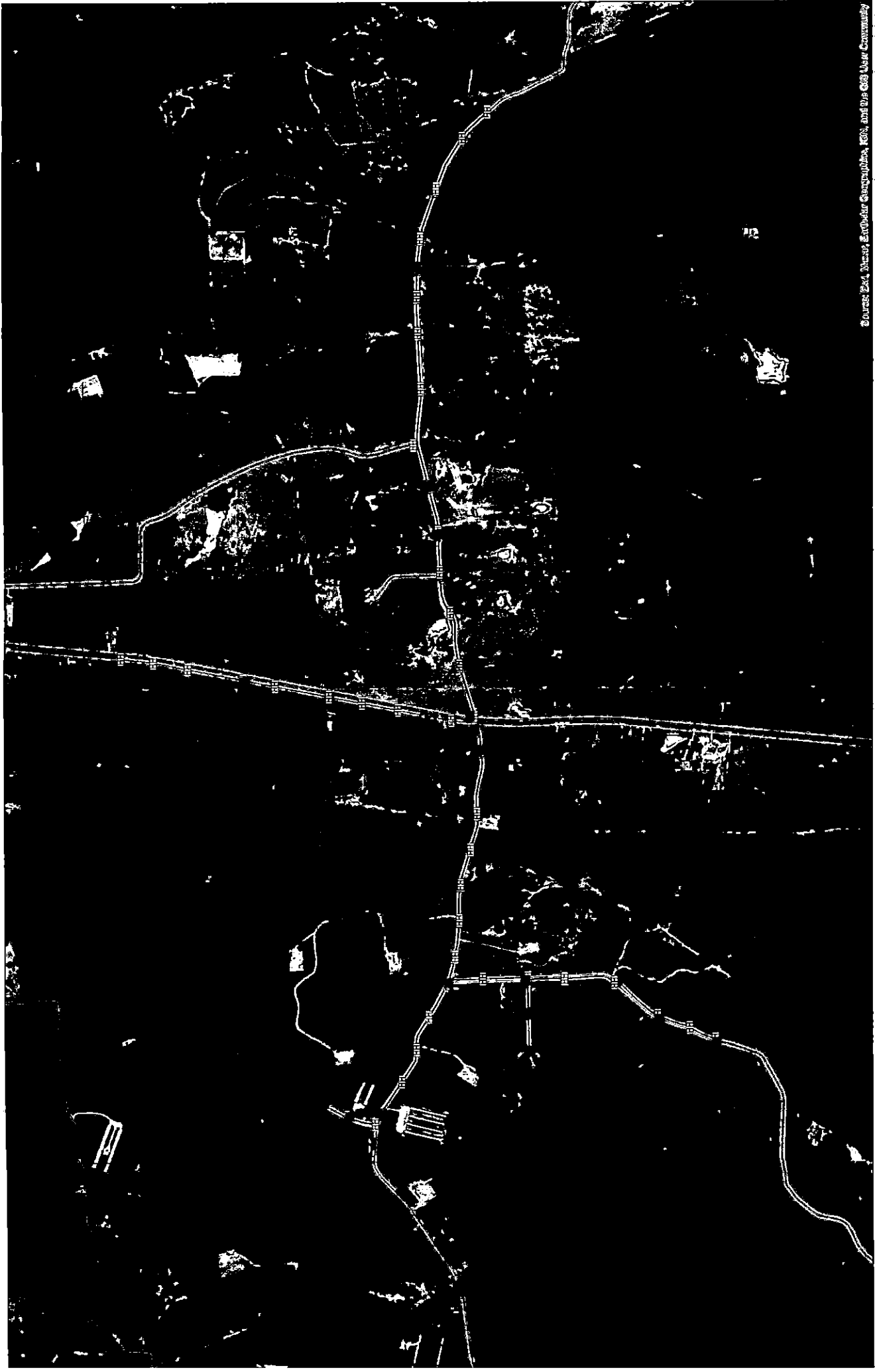
© Curtis East, Street, Earthstar Group, 1993, and the GIS User Community